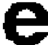
Fig 2: An example of an enlarged bitmap image.

A Bitmap image (or raster image) is comprised of pixels in a grid. Each pixel or "bit" in the image contains information about the colour to be displayed. Bitmap images have a fixed resolution and cannot be resized without losing image quality. Common bitmap formats are BMP, JPEG, GIF and TIFF. Bitmap images tend to have much larger file sizes than Vector graphics and they are often compressed to reduce their size.